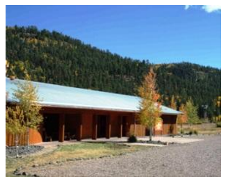
Greer Chapel rents Community Center.

On May 10<sup>th</sup>, we hitched up our travel trailer and, with one mishap (below left), arrived at the Mountain Aire RV Park to assume pastoral leadership of this little chapel that exists only five months out of every year. It seems the "mishap" may possibly be a significant one. We're waiting for the insurance adjuster to come and take a look. While it took two hours to get the trailer properly positioned, we couldn't have asked for a more ideal location (below center) right next to internet range extender and with perfect satellite dish location. Our pad has been extended (below right) and we will soon have our storage shed in place so all the "stuff" under the blue tarp (below center) can be properly stored. The park is older with small spaces, but a real family aura.