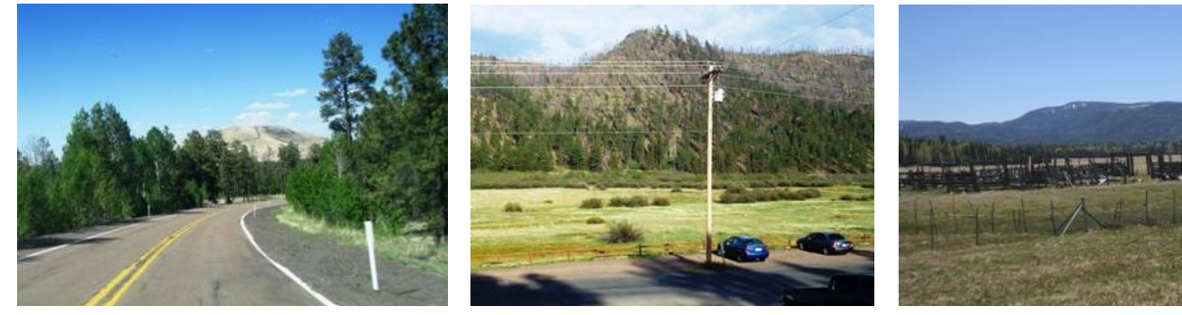
Lava rock harvested from this peak.

The region is beautiful! Area lakes and the Little Colorado River are filled with trout. Deer, Antelope, Elk, Big Horn sheep, mountain lions and bear are present. Highs are in the mid to upper 70's and at nights you need a jacket. So far we have taken one specific "take-some-time-off" little jaunt of 45 minutes on a little road leading into the "Wallow Fire" of 2011 that came right to the edge of Greer (below center), destroying only one home.