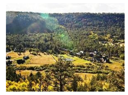
Homes, cabins, resorts scatter the valley.