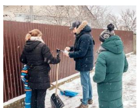
Village Evangelism Outreach