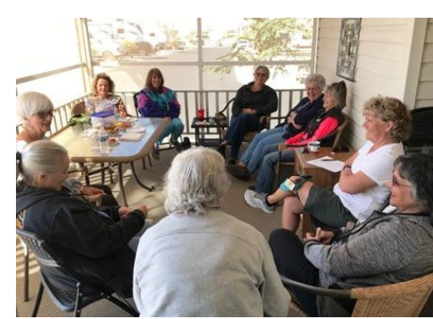
Ladies' Coffee 'N' Conversation on the Porch

As of last Sunday our official ministry here has ended, but we are hosting an informal gathering of 20 or so folks on Easter for coffee, donuts, singing, and the Lord's Supper. Then we leave this next week to begin our 4 day journey to our home in Missouri, remaining there until mid May when we return to AZ for our sixth year of ministry with Greer Chapel. Hopefully things will be much less uncertain and fearful than last Summer, and we'll see that ministry return to its former size and joyful disposition.