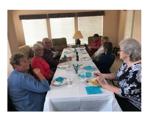
Leadership Appreciation Luncheon