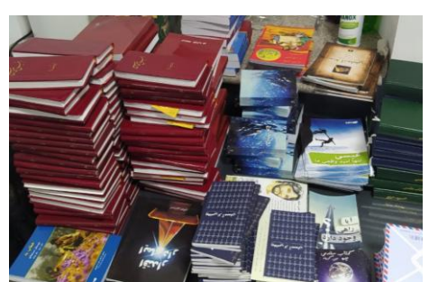
Christian literature ready to be sent